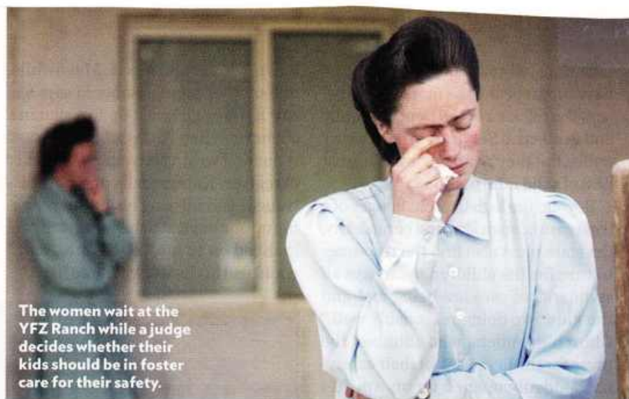
The women wait at the YFZ Ranch while a judge decides whether their kids should be in foster care for their safety.