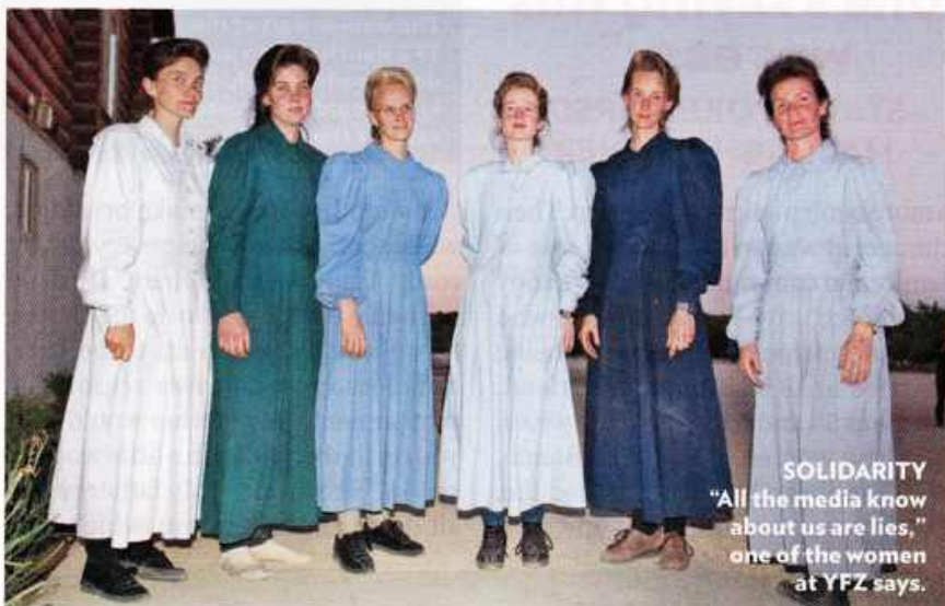
SOLIDARITY "All the media know about us are lies," one of the women at YFZ says.

Not so long ago, say some former sect members, when the FLDS was based mostly in Utah and Arizona, there was