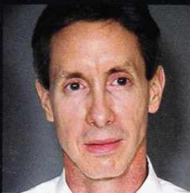
“Perfect obedience produces perfect faith,” Jeffs has said.