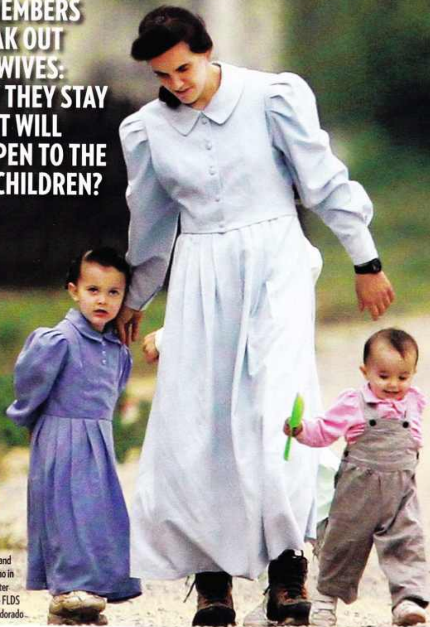
Unidentified woman and children at Fort Concho in San Angelo, Texas, after authorities raided the FLDS sect's compound in Eldorado.